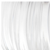
C - CRYSTAL